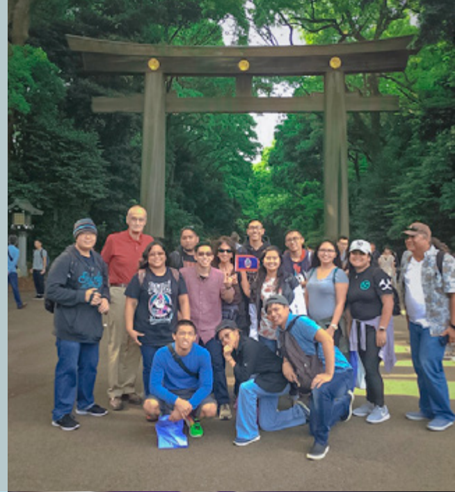
Photo Caption: GCC’s Japan CLUB (Customs, Language, Understanding, Beliefs) poses in front of one of the Meiji Shrine gates in Tokyo on May 28.

Japan CLUB members, faculty and family enjoyed seven days in bustling Tokyo from May 28 to June 2. The group of 15 visited popular historical and cultural sites including Tokyo Tower, Meiji Shrine, the Edo Tokyo Museum, and the Great Buddha in Kamakura. They also attended “That’s Zentertainment,” a live performance that involved all-audience participation, and made their own Cup Noodle and Chicken Ramen at the Cup Noodle Museum in Yokohama. It was an awesome week of touring, shopping, trying different foods, and speaking Japanese!